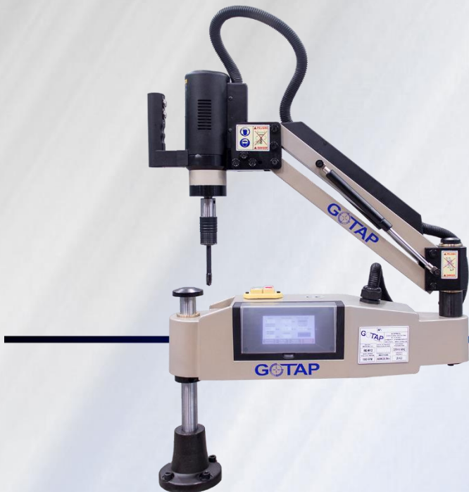
MOD. REV M12