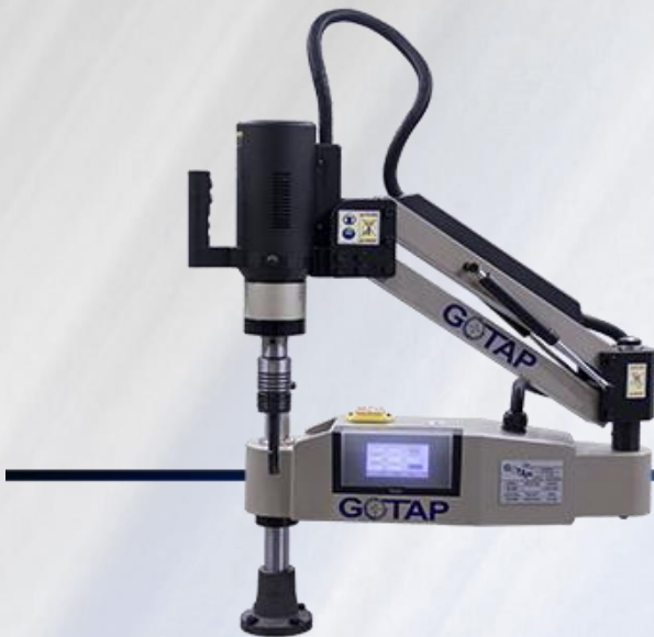
MOD. REV M20