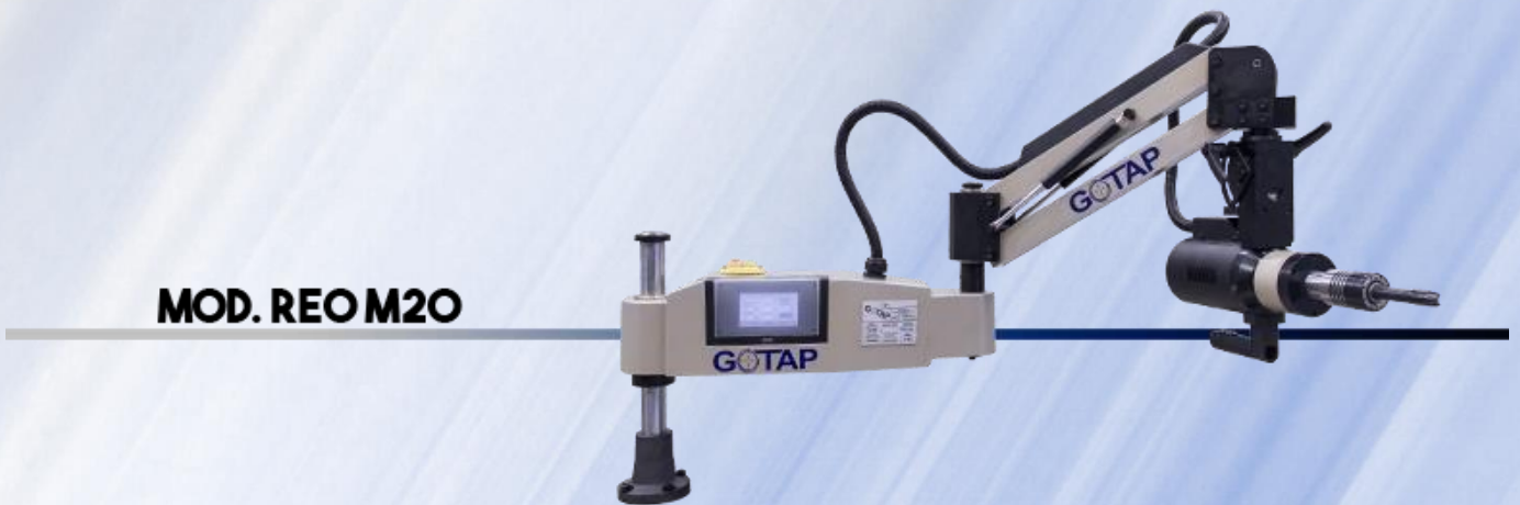
MOD. REO M20